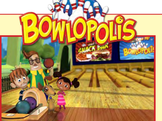
Bowlopolis is the story of a young boy who must learn to bowl to win his father back from the evil Kingpin, who has kidnapped him and is holding him captive in the basement of Bowlopolis .