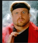
STARRING THE AMAZING JOHNATHAN