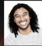
HOSTED BY COMEDIAN LANDRY